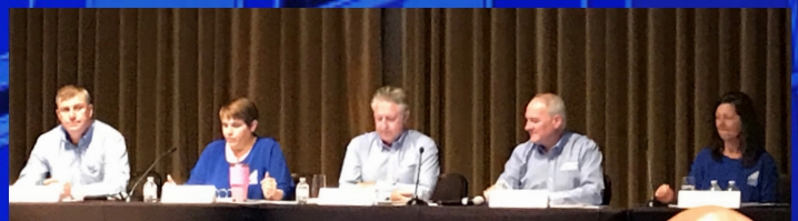
NATIONAL CONFERENCE: 2019 CFMA NATIONAL CONFERENCE