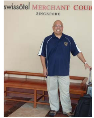
Singapore – I went to Singapore for work this past September as we have a military project for the Navy there.