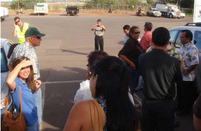
Group waiting patiently...for the latecomers...we won't name them.