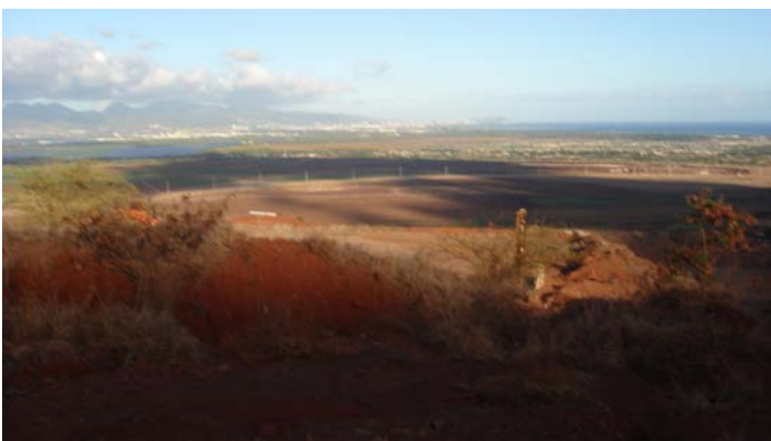
You missed out on a "million dollar" view.