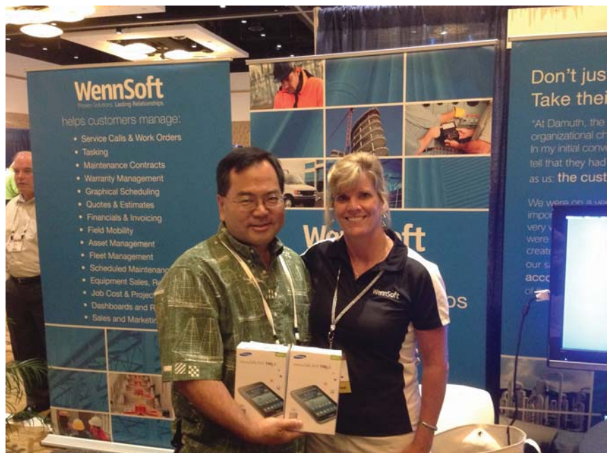
PRIZE WINNER OF TWO GALAXY TABLETS