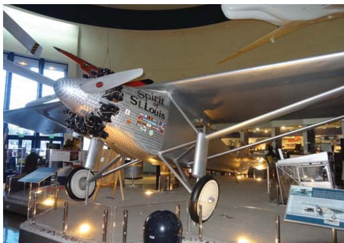
AIR & SPACE MUSEUM