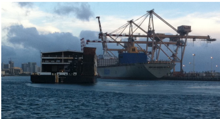
The harbor tour was fantastic!