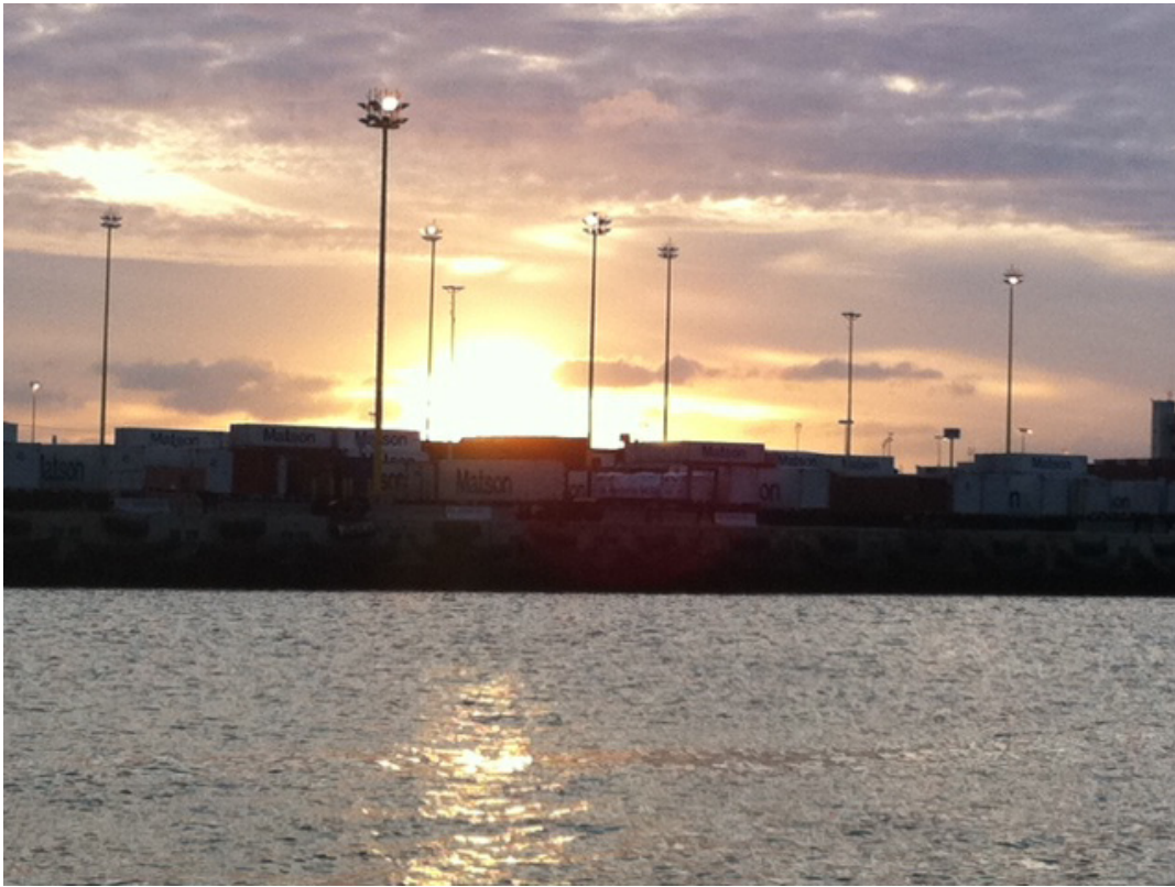
The sunset was fantastic.