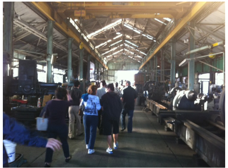
The tour was very interesting.