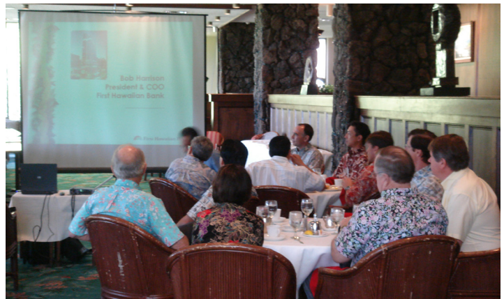
A packed house attended the OCC Seminar.